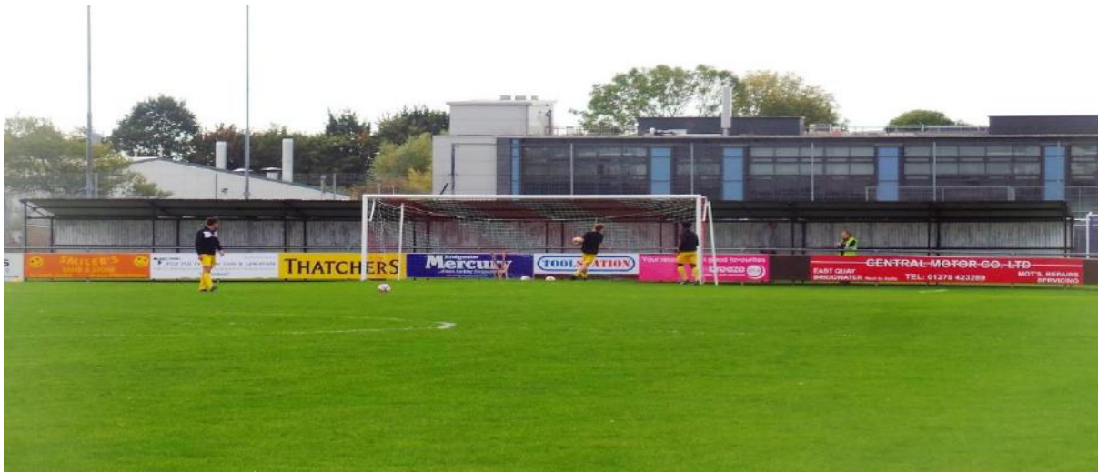
America Pink (Wycombe Wanderer)

Train to Bridgewater Rail Station is 10 minutes from the ground by coming out of the main booking hall and walking up Wellington Street till the roundabout then take the first right and walk down Bath Road past the Rifles Pub and after the bridge take the first right down College Way the ground is the first lane on the right after the bend the ground is in front of you.